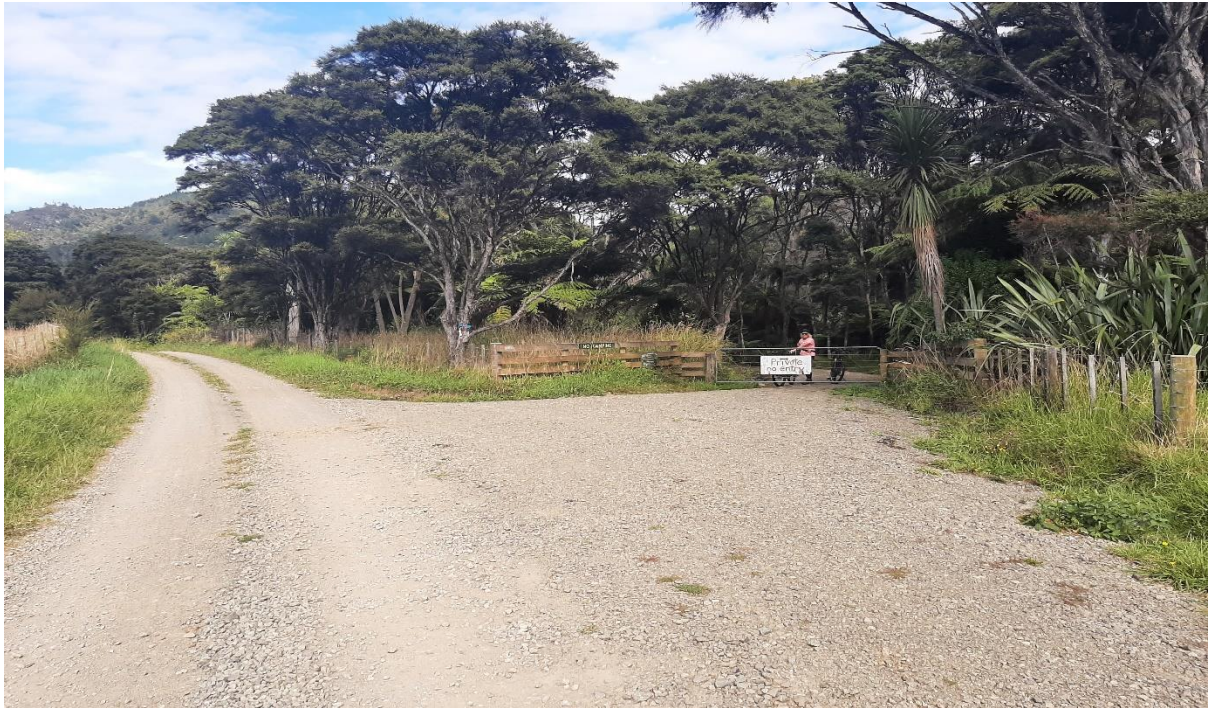
PHOTO NO 7: DOBBS DRIVEWAY LIFT BIKES OVER GATE, HEAD STRAIGHT OUT OF DRIVEWAY ONTO WAIKANAE ROAD. TURN RIGHT AT THE END OF THE ROAD OPPOSITE WOOLSHED, HEAD TOWARDS WAIKAWAU, APPROX 1KM AWAY.

PHOTO NO 8: WAIKAWAU BEACH ACCESS FROM FAR END OF CAMPGROUND /BOAT RAMP ACCESS. PLEASE DO NOT RIDE BIKES ON THE BEACH AS TEMPTING AS IT IS!