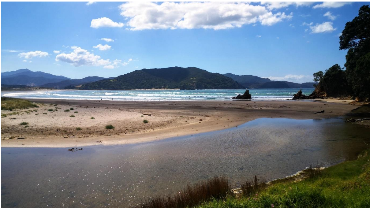
PHOTO NO 8: WAIKAWAU BEACH ACCESS FROM FAR END OF CAMPGROUND /BOAT RAMP ACCESS. PLEASE DO NOT RIDE BIKES ON THE BEACH AS TEMPTING AS IT IS!

REJOIN ROAD AND HEAD OVER THE HILL TO LITTLE BAY APPROX 2KMS IF YOU WISH.