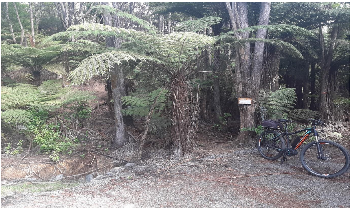
PHOTO NO 6: TRACK EXIT TO/FROM DRIVEWAY. HEAD STRAIGHT OUT ONTO DRIVEWAY AND THROUGH STREAM (TAKE CARE SLIPPERY ROCKS!)