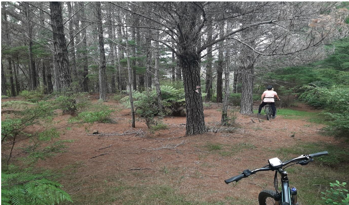
PHOTO NO 4 : TRACK FORKS IN PINES KEEP RIGHT. ARROW POINTS TO RIGHT.

TAKE NARROW TRACK ON THE OTHER SIDE OF THE WALKING ACCESS SIGN.