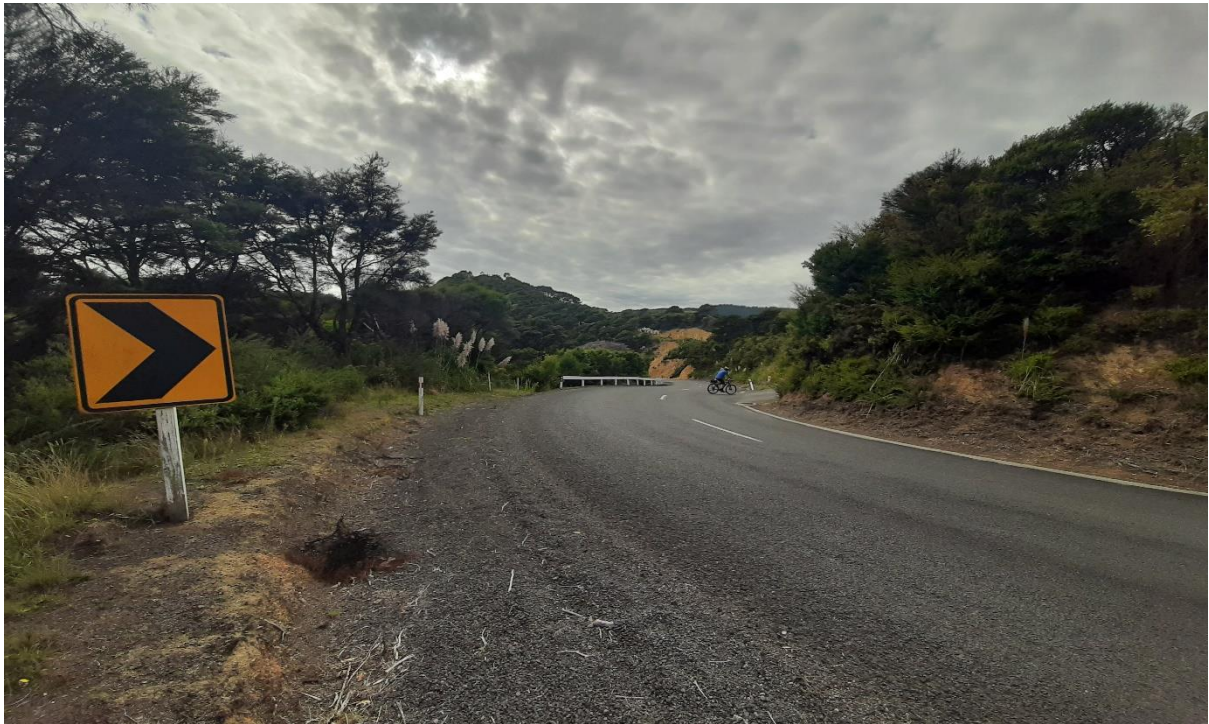
PHOTO NO 1: TOP OF BIG BAY HILL - FIRST HILL 2KMS FROM COLVILLE PREPARE TO TURN RIGHT, WATCH FOR TRAFFIC!