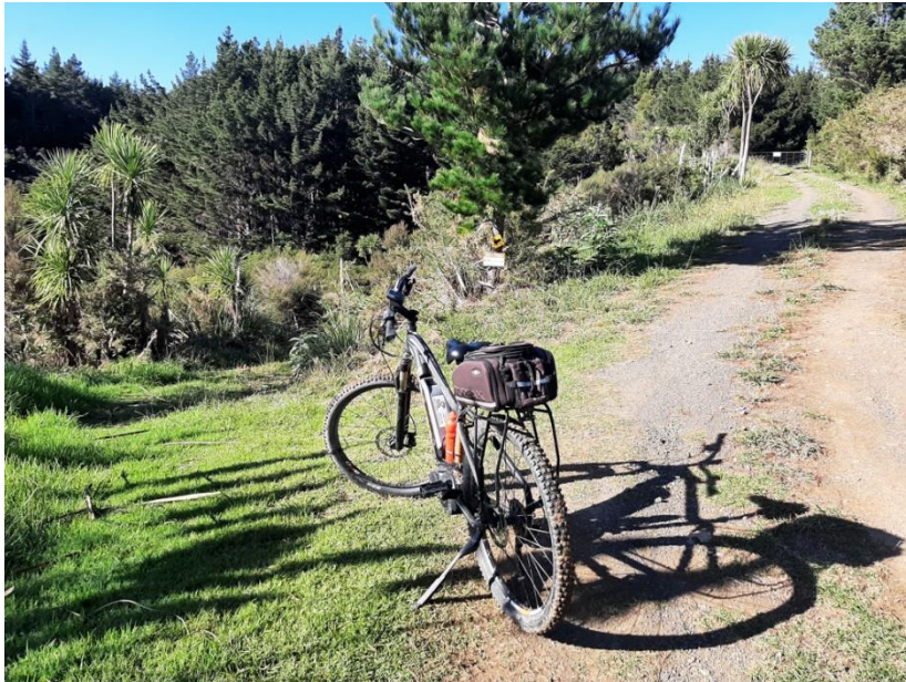
PHOTO NO 3: AT THE SUMMIT - DRIVEWAY TURNS SHARP RIGHT TOWARDS GATE – PRIVATE PROPERTY NO ACCESS.

TAKE NARROW TRACK ON THE OTHER SIDE OF THE WALKING ACCESS SIGN.